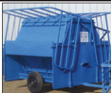
Werk Weld, Inc. Creep & Self Feeders